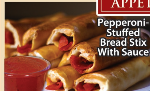
Pepperoni-Stuffed Bread Stix With Sauce