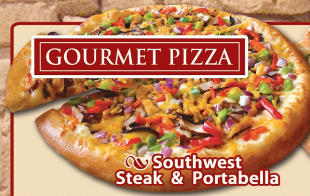
Southwest Steak & Portabella