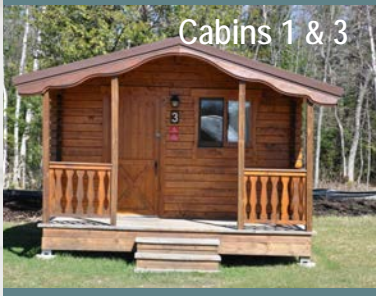
Cabins 1 & 3